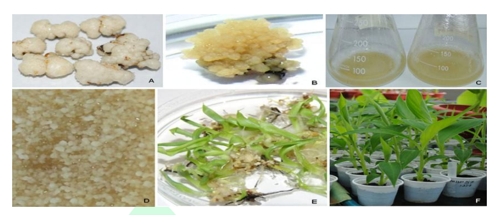
Stages involve in embryogenic cell suspension