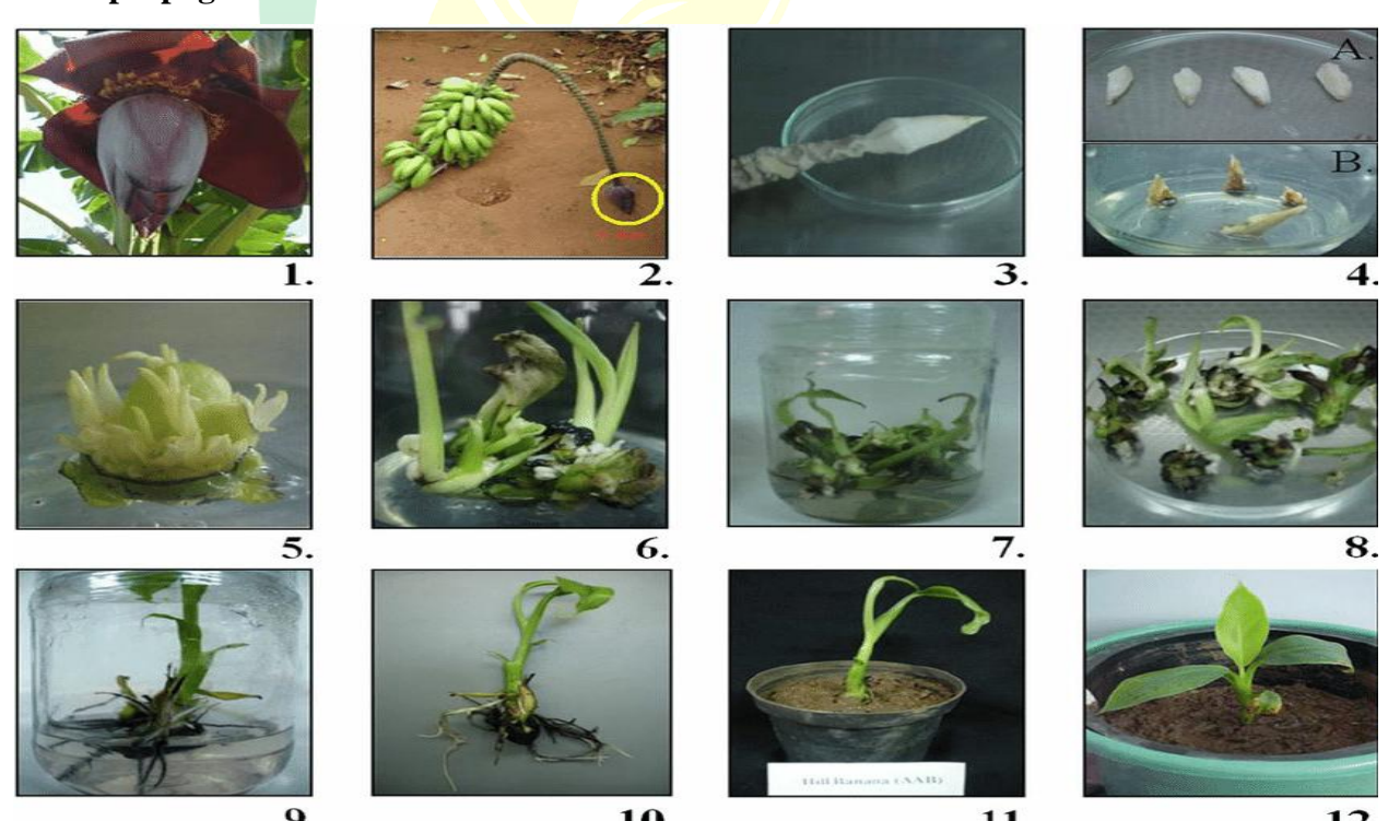
Stages involved in the micro propagation from male floral meristems of banana (Musa spp.) cultivar 'Virupakshi' (AAB).